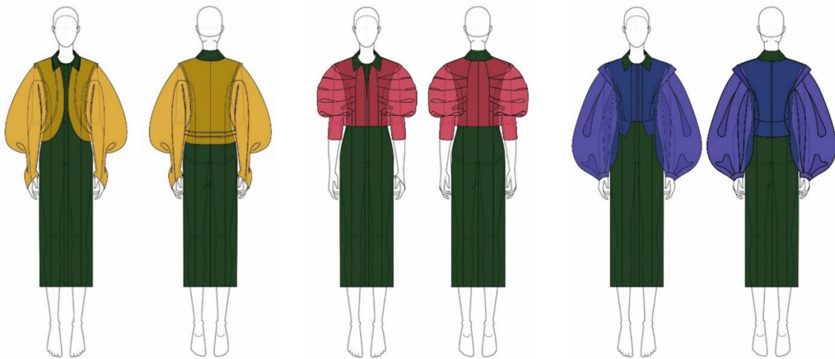
Figure 2 – Compositional and technical drawing of the images being developed

A bolero made of bright-colored coat fabric is worn over the vest, which makes the image bright, interesting and comfortable. Bolero is an accent element of the image, which can be removed or replaced if desired. The bolero design has articulations coming out of the shoulder seam and coming into the side, which create three-dimensional elements on the mill. The sleeve is one-piece, having a rounded configuration of the middle seam and a curly bottom line. With articulations coming out of the armhole and coming into the bottom line, and vertical pinches at the bottom of the sleeve (V. V. Getmantseva, 2016, 34-57). A technical sketch of the bolero, as well as alternative models of the top, is shown in Figure 2.